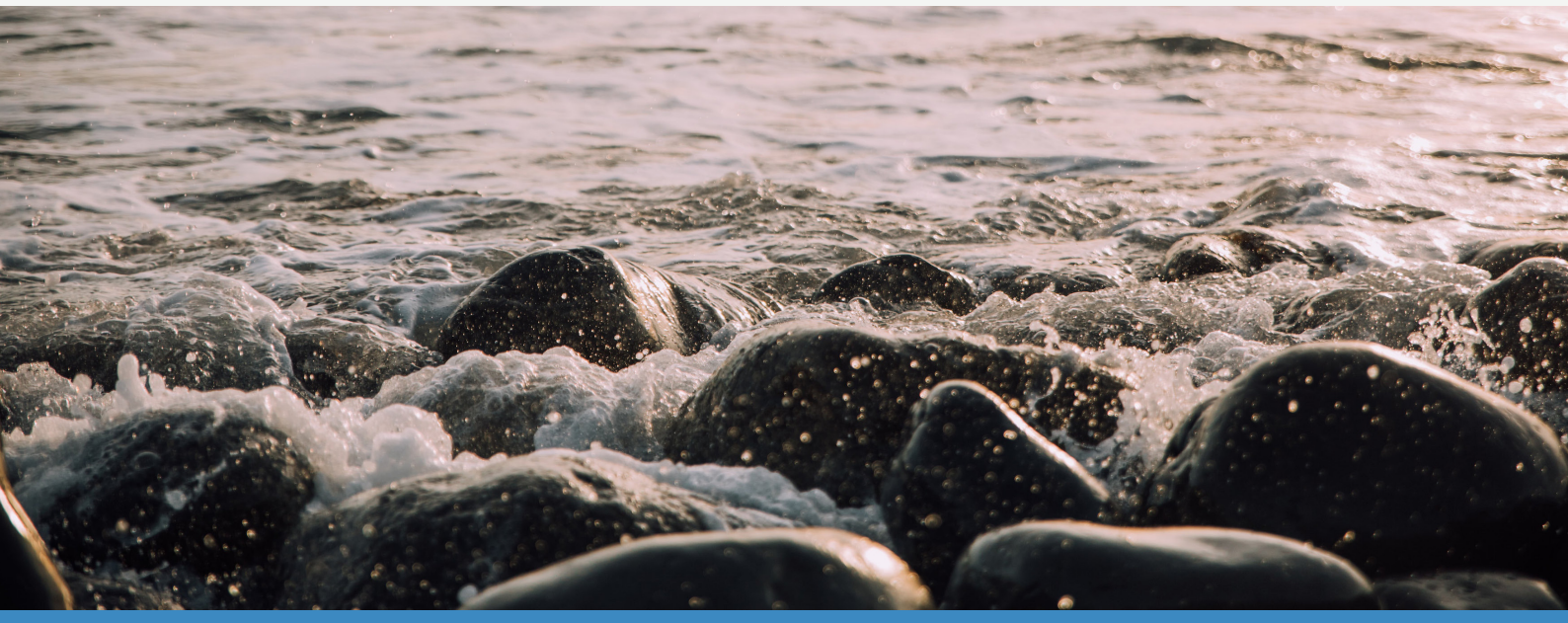
Issues specific to if your son/daughter is an ADULT